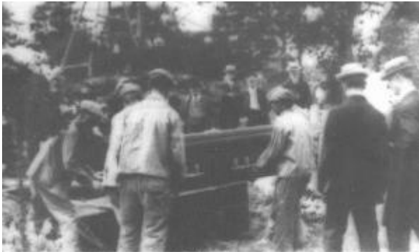
Scene at interment of body of Leo M. Frank, lynched in Georgia, in Mount Carmel cemetery, Cypress Hills, New York City. There was no demonstration at the cemetery.