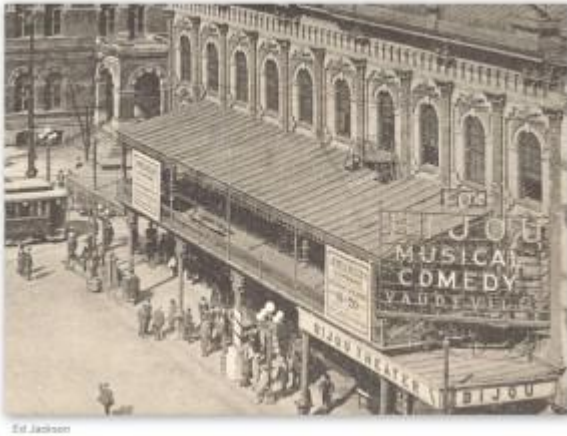
The Bijou Theater, Atlanta, Georgia — ironically, adjacent to where Leo Frank Trial was held

speculate: Was she naturally sterile, or was Leo no longer interested, or both? If the rumors were true about Leo Frank seeking out dalliances with Atlanta's prostitutes, in an age where there were no antibiotics, could he have given his once-virgin wife one of the many commonly known STDs or the silent sterilizer Chlamydia? And surely what was most shaming is that there was evidence discovered in 1914, during Frank's appeals, that he inseminated one of his former factory child laborers, a naive young teen who became pregnant and was shipped off to a home for unwed mothers in Ohio, something that — no matter how much she repressed it — would have mortified Lucille.