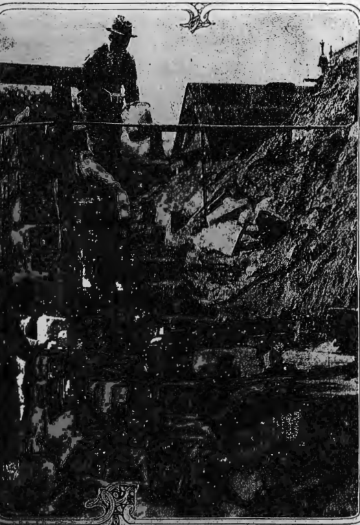
Where workers are repairing the Ivy Street retaining wall which crumbled because of faulty construction. It was necessary to remove all the earth which had been filled in, resulting in a long delay in the completion of the city's part of the work.