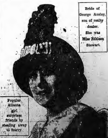
Popular Atlanta girl surprises friends by eloping away to marry.

At this time, it is the intention of the defense to begin with the first statement by which Conley testified himself with the case after he had remained silent for two weeks following his arrest.