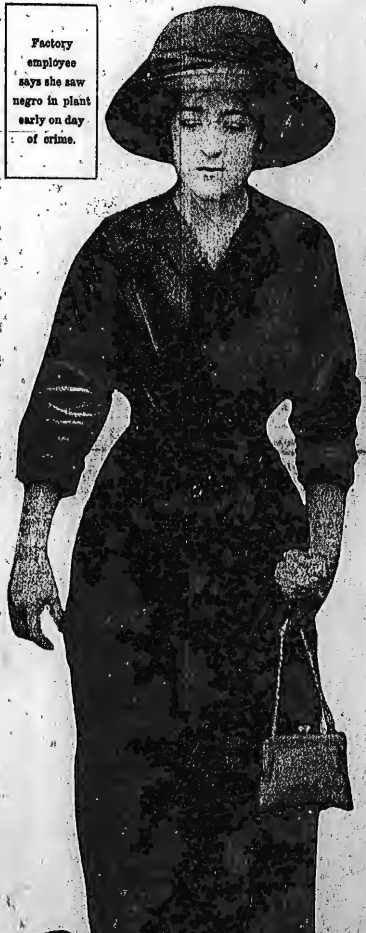
Factory employee says she saw negro in plant early on day of crime.