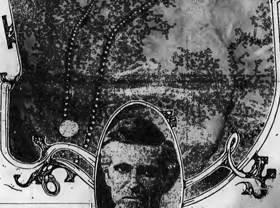
Anna Held to Wear Diamond Stockings. Makes Announcement That She Will Appear in Gown Without Corsets and Bejeweled Hosiery.